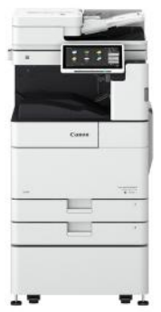
iR ADV DX 4700