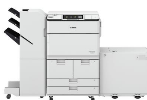
iR ADV DX 8700

Wherever a business is in its digital transformation journey, the imageRUNNER ADVANCE DX portfolio integrates physical print and digital evolution together seamlessly to help businesses design digital document and capture solutions and processes that are aligned to their industry, and the people they work with. Ensuring they can transition to digital solutions, at a speed that helps them achieve their goals faster, while keeping processes simple and secure.