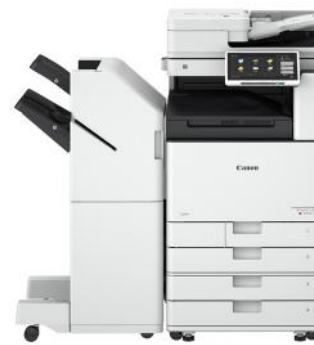
iR ADV DX C3700