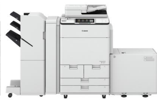
iR ADV DX C7700