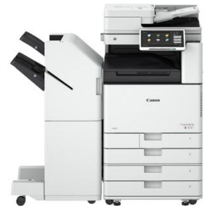
iR ADV DX C3700

This enables digital technology in keeping with modern organisational values, delivering and supporting maximum functionality while having a positive impact on the workplace's environmental footprint.